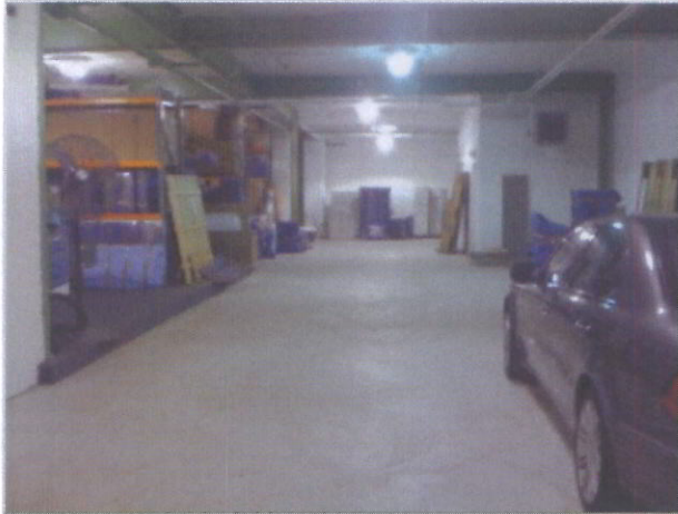
Fully renovated at Larkin Plaza