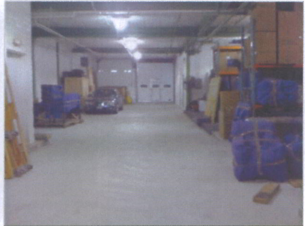
Fully renovated at Larkin Plaza